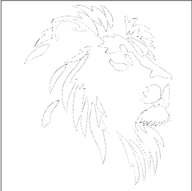
Stop #: 1 Element: Code: 1003 Name: White Chart: Madeira Classic 40 Stitches: 5,085 Thread used: 18.60m